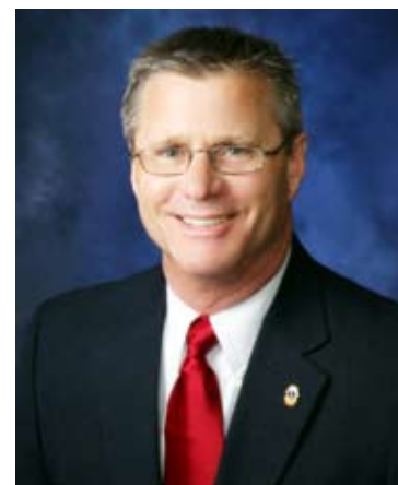
DISTRICT GOVERNOR BRYCE DAY