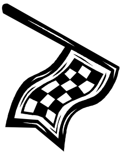
Exhibit Table Registration Form 2009 LIONS MID-WINTER RALLY January 16-18, 2009 ~ Salina, Ks.